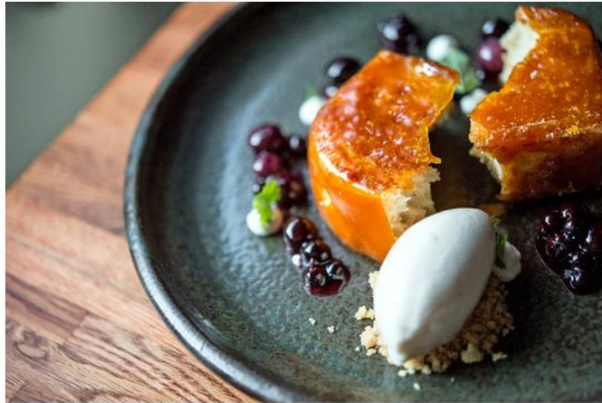
Bâtard's caramelized milk bread with berries and brown-butter ice cream is already a certified hit.